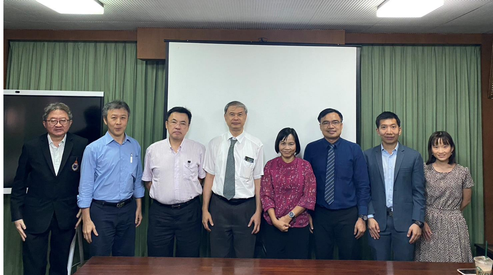
MEETING WITH THE THORACIC SOCIETY OF THAILAND UNDER ROYAL PATRONAGE 10 TH MARCH 2023